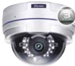
CAM4210 & CAM4220