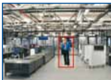
Entrance flow counting

All Surveon cameras support real time VI with the Surveon VI suite featuring functions such as foreign & missing object detection, forbidden area, intrusion detection & camera tampering detection.