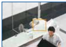
Missing object detected