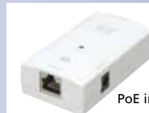
PoE injectors: page 185