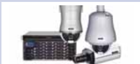
Other Surveon camera styles available. Contact us for details.