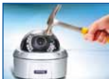
IP66 Impact resistant